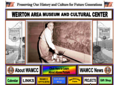
Webstie front page

Future plans for the photo gallery include a book, which will be available by April, 2010, and a choice of 2 different photo calendars, which will be available by October 16, 2009. As with everything the Museum produces, the book and calendars will be of the highest quality.